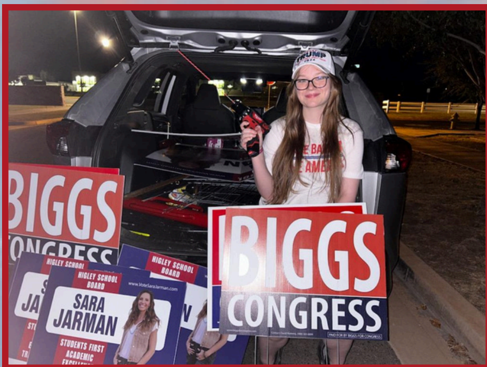
Pounding Signs with Turning Point