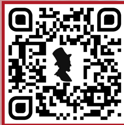
Lincoln Luncheon Video Highlights