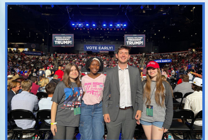
October 24th Trump Rally