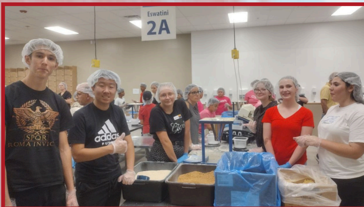
Feed My Starving Children Event