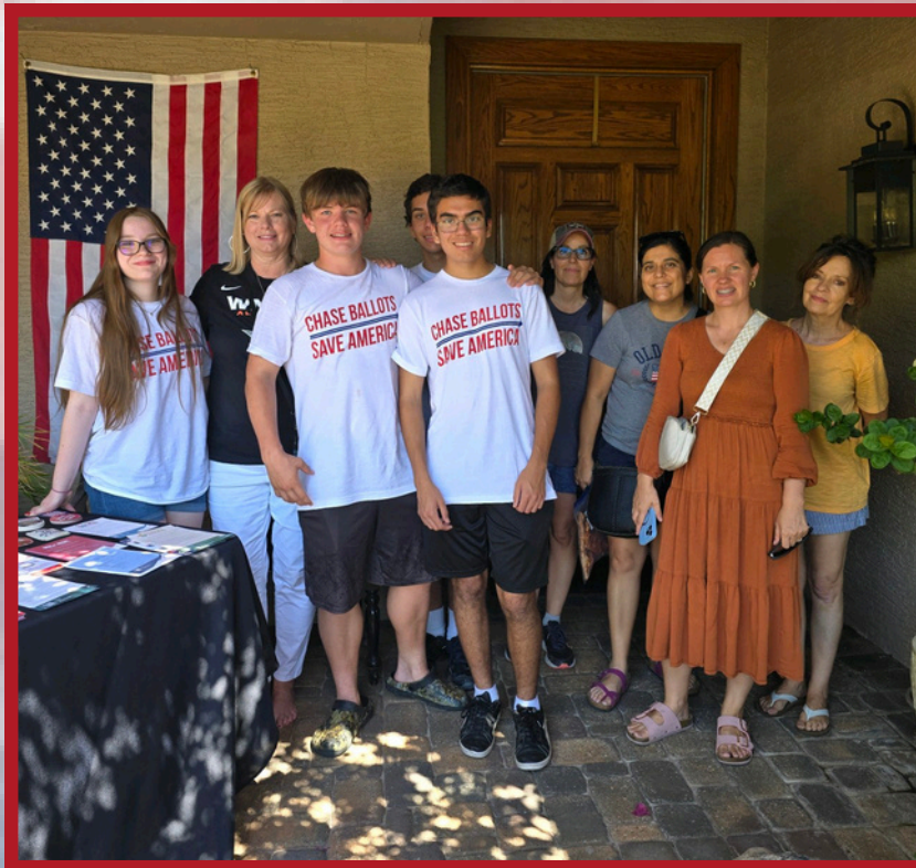
Chase the Vote